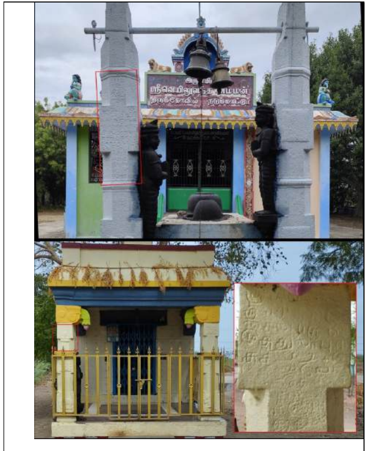
Fig 5. Inscription from Nadukattur and M.Kovilpatti