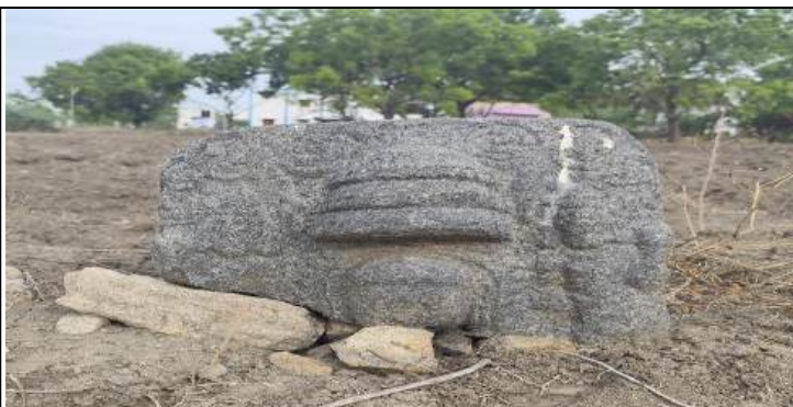
Fig 3. Jain sculpture

Virapatti is located about 15 kilometers from Ettayapuram near M.Kovilpatti on the way to Malaipatti. A pillar is identified near Government school at Virapatti. The pillar having the depiction of chakra and chunk.