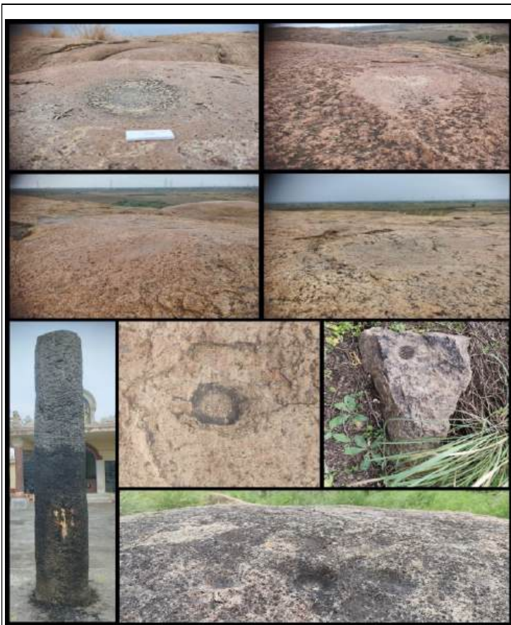
Fig 4. Archaeological remains from Malaipatti

Nadukattur village is located about 28 kilometers from Vilathikulam on the way to Muthupatti. Veyiluvandhamman temple is located north of the village. One of the outside standing pillars having Tamil inscriptions. Inscription mentions “1118 ஸ்ரீசித்திசபானுவருசம்மாசிமாதம்26